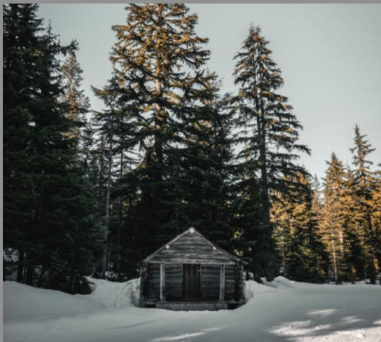
ELVES AND THE SHOEMAKER