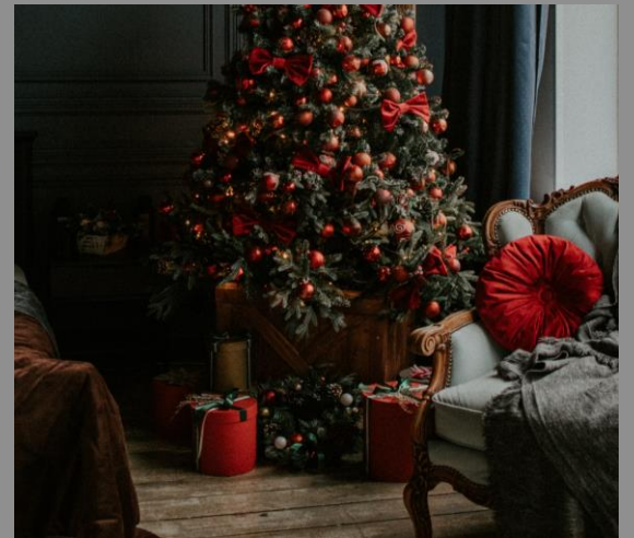
NIGHT BEFORE CHRISTMAS