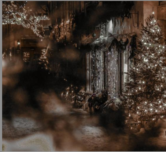
A CHRISTMAS CAROL