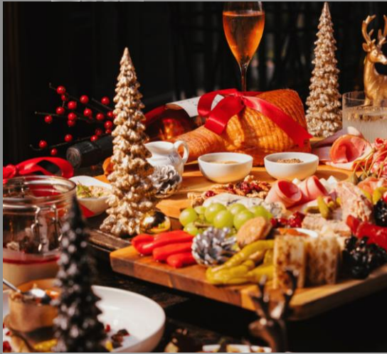
PLEASE SIR, I WANT SOME MORE